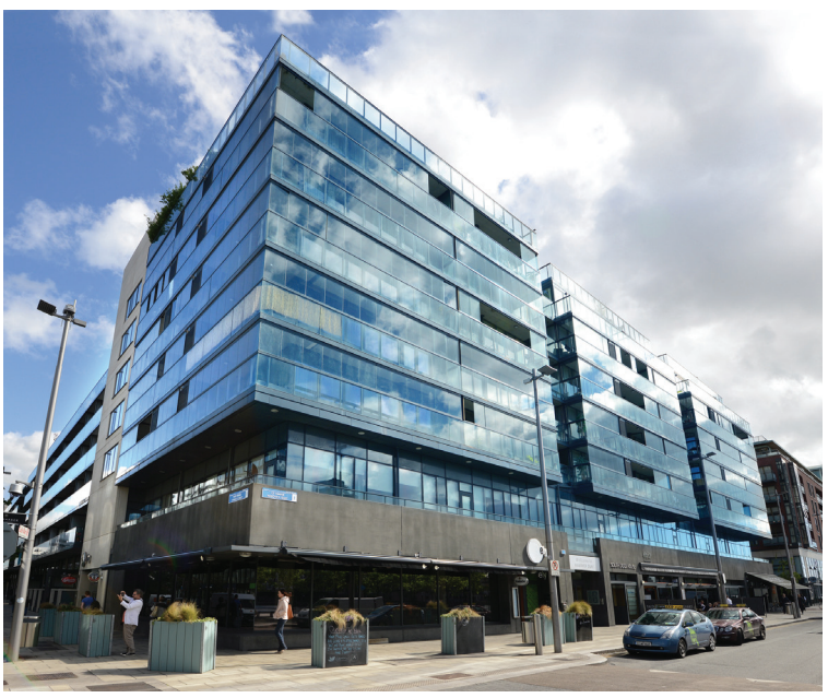
South Dock House in Dublin was acquired by Hibernia REIT in 2014 as part of a loan portfolio takeover from Ulster Bank.

"The public market in Spain experienced a surge of new listings," says Pine, "and Italy is expected to follow suit."